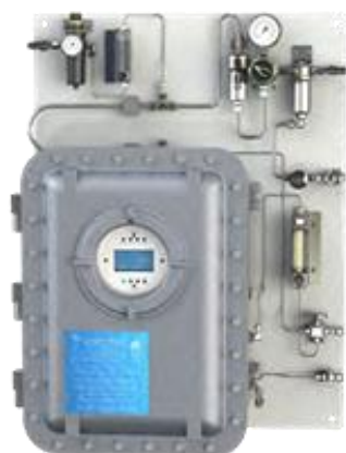
Hydrocarbon Analyzer shown with a Sample Conditioning System for Saturated & Dirty Gas